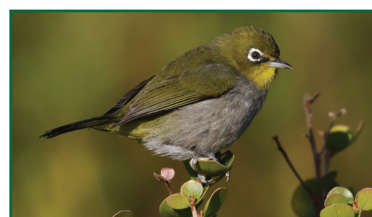
Cape White-eye Zosterops capensis