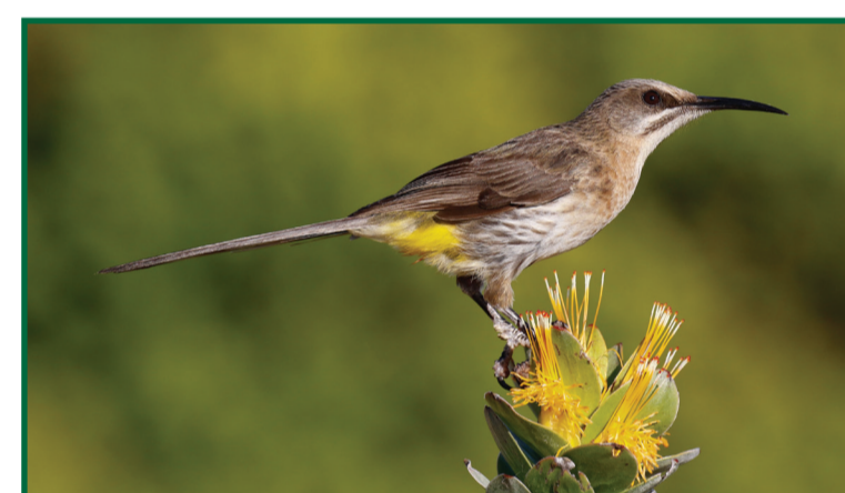
Cape Sugarbird Promerops cafer