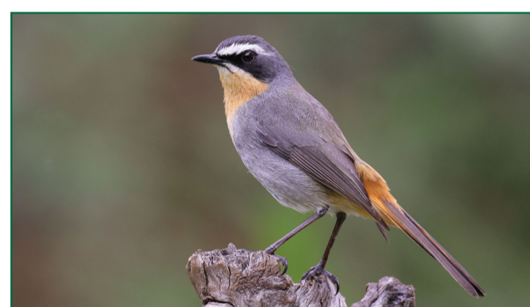
Cape Robin-chat Cossypha caffra