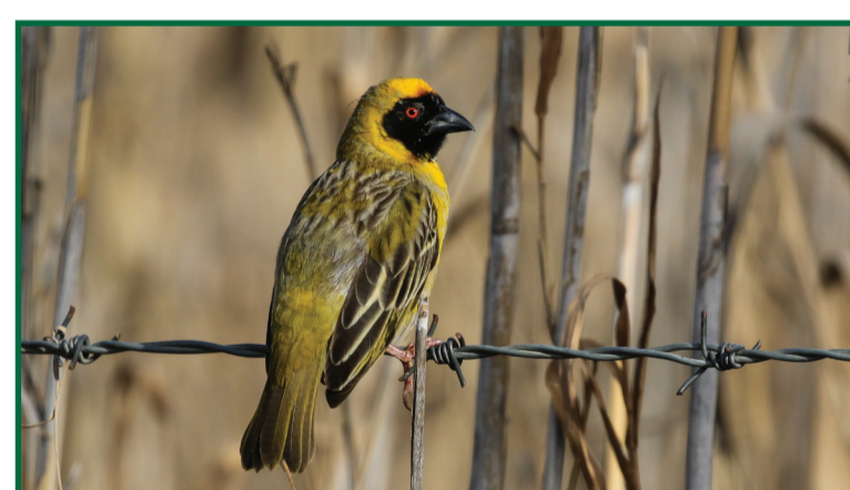
Southern Masked Weaver Ploceus velatus