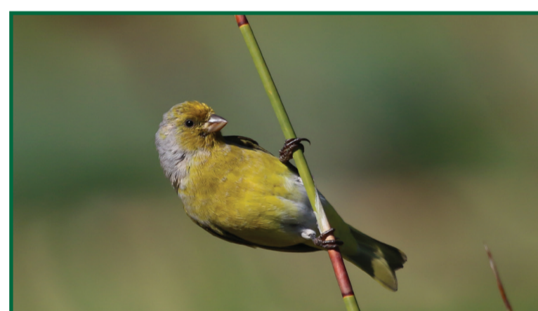
Cape Canary Serinus canicollis