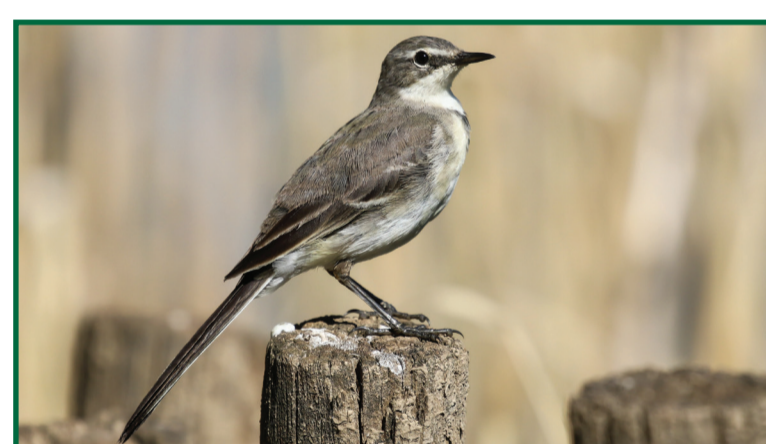
Cape Wagtail Motacilla capensis