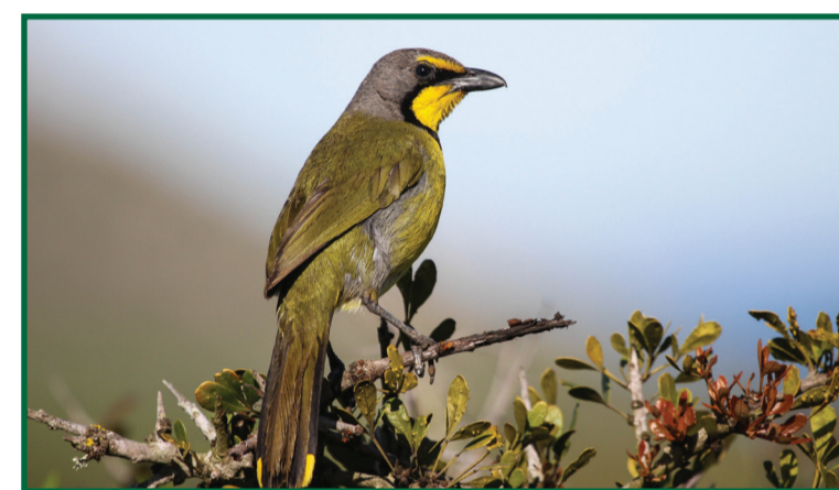
Bokmakierie Telophorus zeylonus