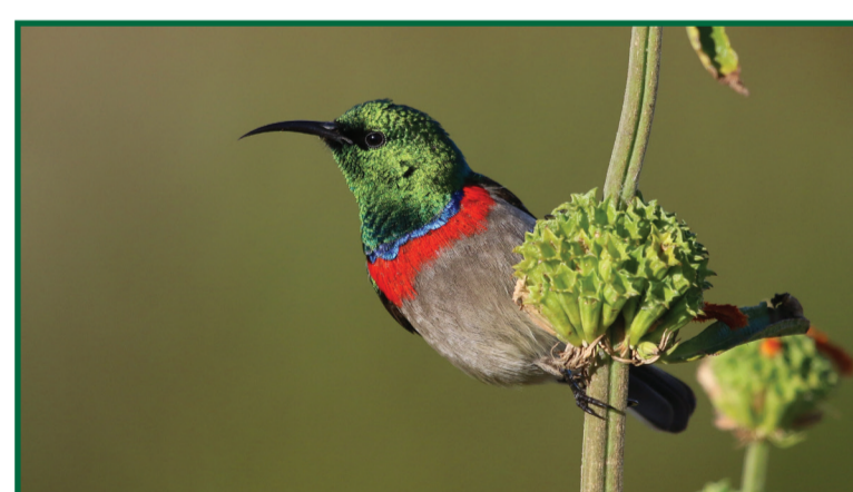
Southern Double-collared Sunbird Cinnyris chalybeus