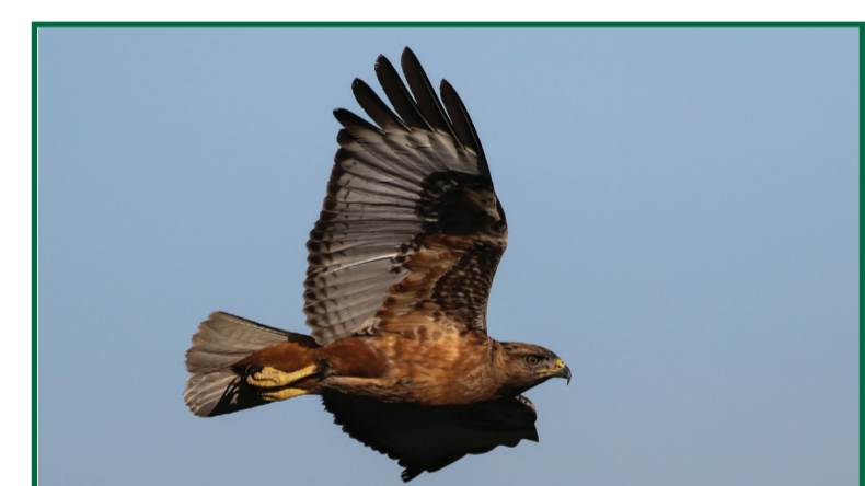
Jackal Buzzard Buteo rufofuscus