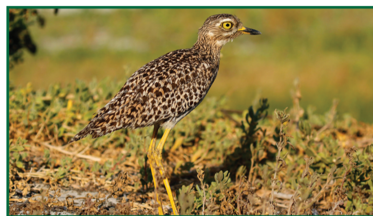
Spotted Thick-knee Burhinus capensis

Over 400 of South Africa's 856 bird species have been recorded from the Cape Town area. Eighteen of these are endemic to South Africa and 28 have been assigned Red Data status. The very high number of bird species recorded in the city is due to a large diversity of habitats being present. This includes wetlands, coastline, mountains, agricultural areas and suburban gardens. Wetlands are particularly species rich with many migratory species augmenting the numbers during summer. Some of our most threatened species can be seen along our spectacular coastline. These include African Penguin ( Spheniscus demersus ), Cape Gannet ( Morus capensis ) and Bank Cormorant ( Phalacrocorax neglectus ), which are all classified as Endangered and are endemic to the southern African coast. Of special interest to bird enthusiasts are the six fynbos endemic birds, all of which are found within the city boundaries. These are Protea Canary ( Crithagra leucoptera ), Cape Siskin ( Crithagra totta ), Victorin's Warbler ( Cryptillas victorini ), Cape Rockjumper ( Chaetops frenatus ) and the nectar-feeding Orange-breasted Sunbird ( Anthobaphes violacea ) and Cape Sugarbird ( Promerops cafer ).