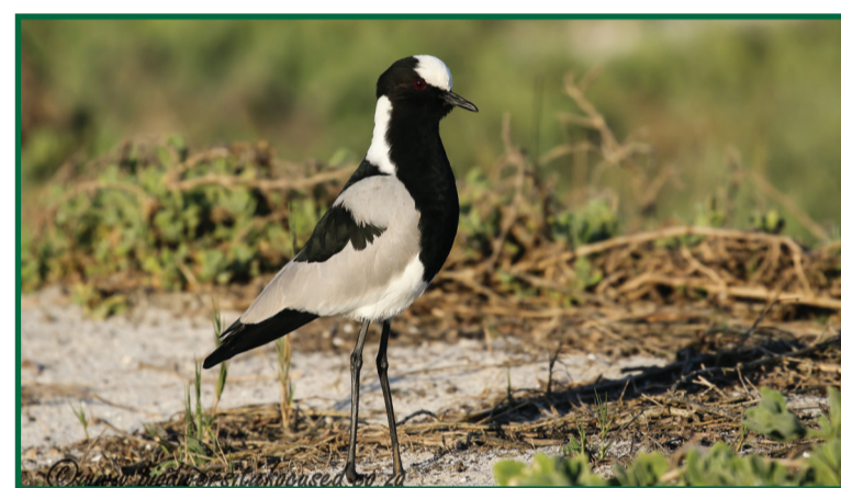
Blacksmith Lapwing Vanellus armatus