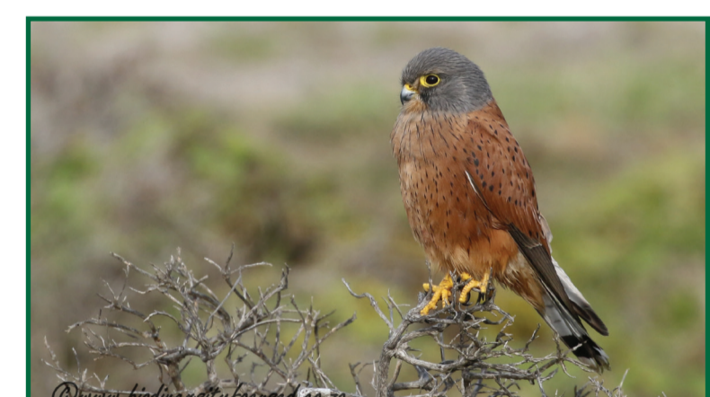
Rock Kestrel Falco rupicolus