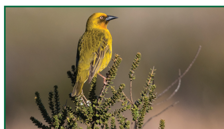
Cape Weaver Placeus capensis